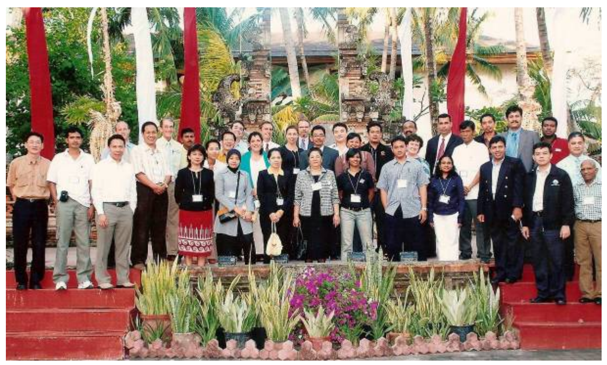
Participants at the Second Regional Coastal Community Resilience Workshop in Bali, August 14-16, 2007