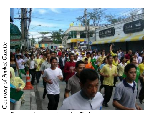
Community members in Phuket evacuate as part of the Andaman Wave 2007 drill

The US Forest Service (USFS) and other partners have conducted intensive training for approximately 600 disaster managers on efficient procedures and dissemination of warning messages. Sri Lanka, Indonesia, and Thailand have incorporated these disaster management systems and practices into their national frameworks and will continue to institutionalize them through training programs at the sub-national levels using materials developed under the US IOTWS Program.