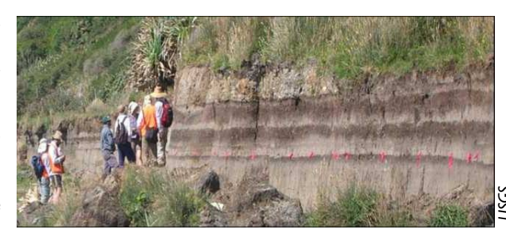
Indonesian researchers and USGS staff during a field trip to examine evidence of recurrent tsunamis and mudslides

National Oceanic and Atmospheric Administration (NOAA) has successfully deployed deep-ocean tsunami detection tsunameters ("DART buoys") in partnership with Thailand and Indonesia, and upgraded coastal sea-level gauges in Sri Lanka, Indonesia, and the Maldives. NOAA also upgraded Global Telecommunications System (GTS) connections in the Maldives and Sri Lanka, which improved the ability to share and receive critical data. The U.S. Geological Survey (USGS) has supported countries in the region to enhance seismic detection and hazard assessment capability.