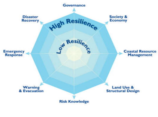
Eight elements of coastal community resilience

Partners in the US IOTWS Program developed the CCR framework through a series of workshops and discussions with practitioners and specialists from government agencies and non-governmental organizations throughout the Indian Ocean region. Through this participatory process, eight elements of resilience were identified as essential for CCR. These elements incorporate long-term planning, disaster planning and preparedness, governance, and risk knowledge. Enhancing resilience in all of these elements is considered essential to reduce risk from coastal hazards, accelerate